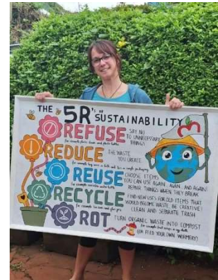
5R's on Sustainability education

The schools mostly asked for a morning program with general information about farming, environmental care, appreciation of nature, knowledge of different vegetables and animal care. School groups that stayed for a whole day mostly chose for the ‘farm to fork’ program. During this program the students prepare their own lunch with fresh farm produce. About 40 – 50% of the students visiting Mlango Farm have never been to a farm before. Usually the main purpose of the visit is to experience farm life, get an understanding of healthy food and where our food comes from and the importance of caring for the environment.