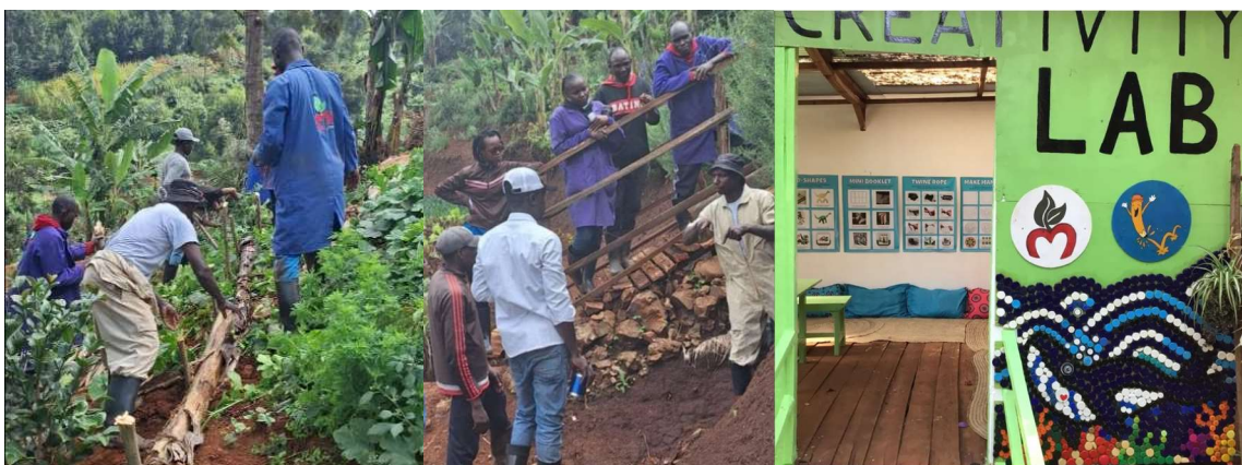
Education on Permaculture