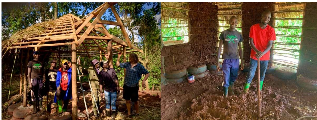
COB building in progress