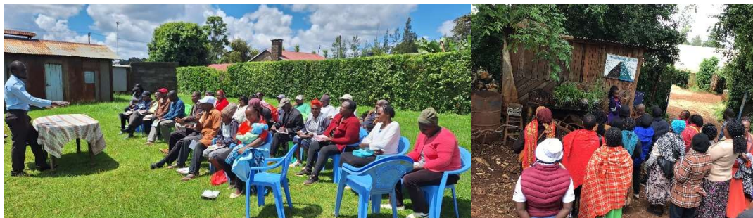
Farmers training on organic farming