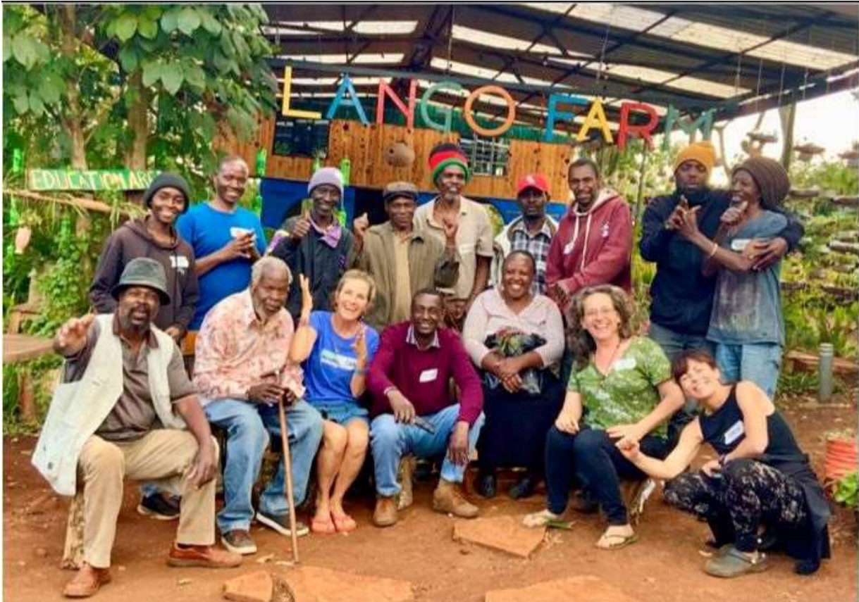
Ngecha artists workshop