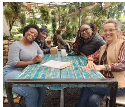
Board Mlango Farm Foundation